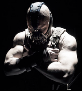
Bane Batman's foe in "The Dark Knight"